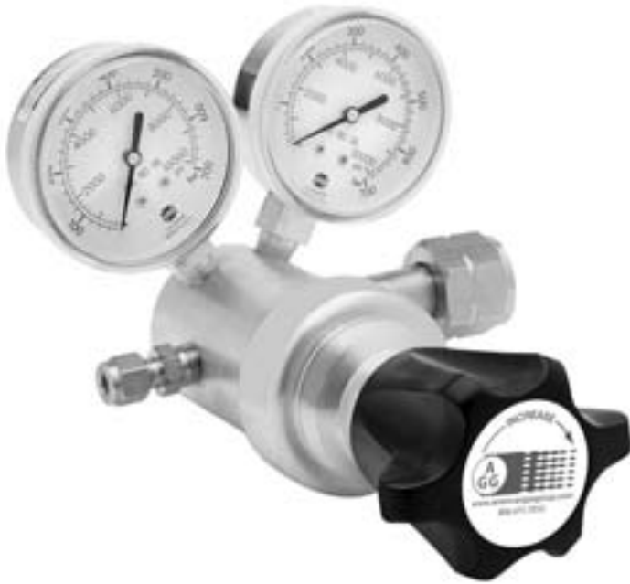
Model 8700-6000-677 shown

The Model GP 8700 is a single stage high pressure regulator that is designed to operate on high pressure cylinders up to 7500 PSIG. The Model GP 8700 is suitable for: